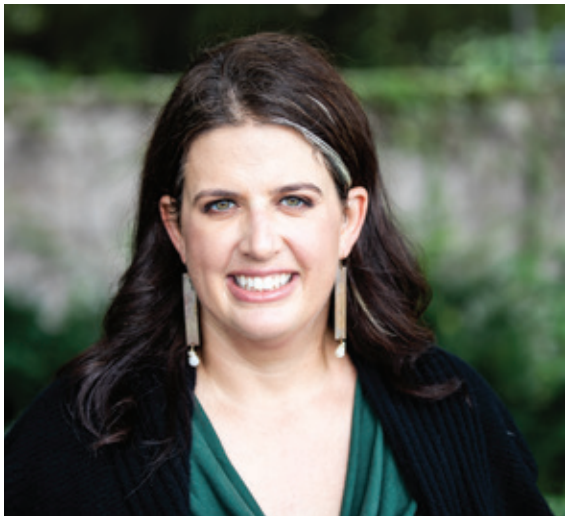
John D. & Catherine T. MacArthur Foundation

Dear IRAP Community, We are putting out this Report in a complicated time marked by the need for bold action and critical reflection. In the past two years, IRAP has reached many important milestones in our efforts to create and protect pathways to safety for refugees and other forced migrants, and we are incredibly proud of all that we have achieved on behalf of our clients. But in the same time period,